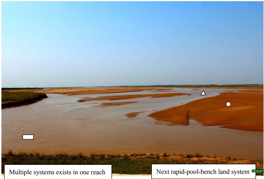
No.5 :A rapid-pool-bench land systems in the lower reach of the Yallow River in China.