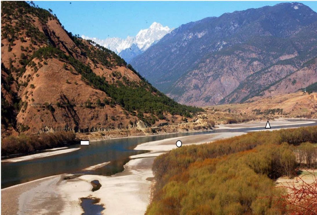
No.1 A rapid-pool-bench land system in the upper reach of the Yangtze River in China. The square symbol: pool; the triangular symbol: rapid; the circle symbol: benchland. The same below.

Sixteen of the rapid-pool-benchland systems (RPBS) in China, USA, Australia and Africa are as follows. There are many other RPBS in the upper and lower reaches of these RPBS in the photos.