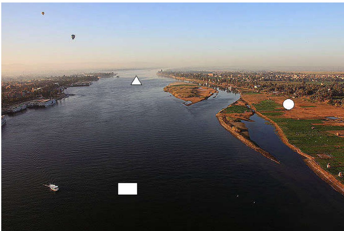
No.14: A rapid-pool-bench land system in the Nile River in Africa.