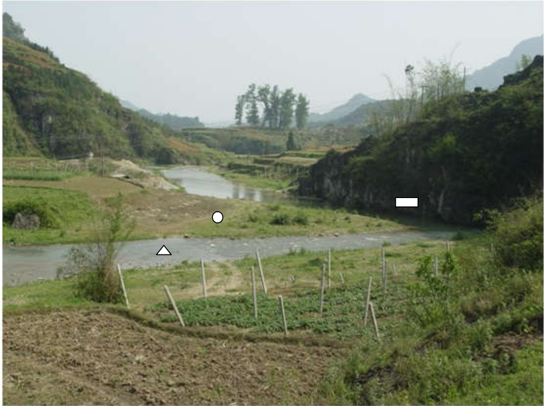
No. 7: A rapid-pool-bench land system in the upper reach of the Dulu River in China (a RPBS for sampling).