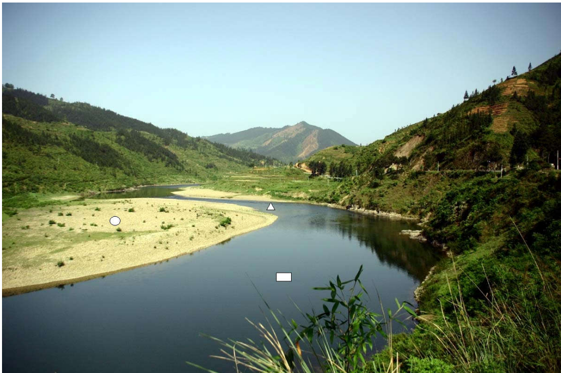
No.8 A rapid-pool-bench land system in the middle reach of the Dulu River in China (a RPBS for sampling).