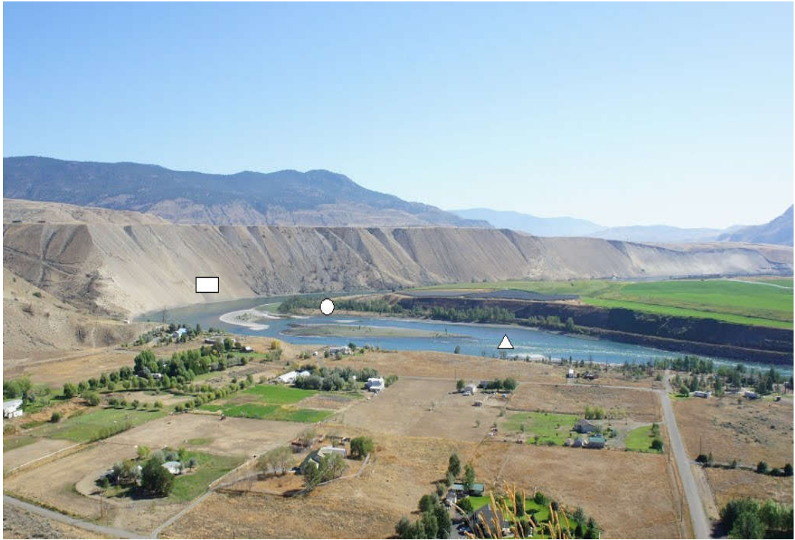
No. 9: A rapid-pool-bench land system in one river in USA.