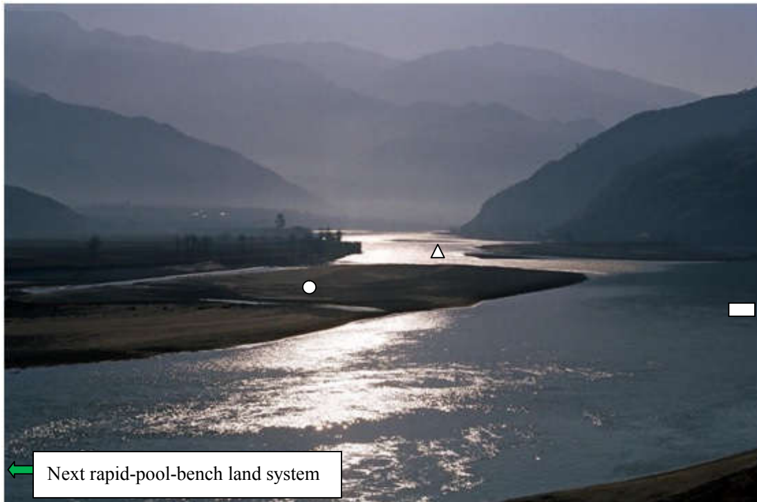
No. 2: A rapid-pool-bench land system in the Jingshajiang River in China.