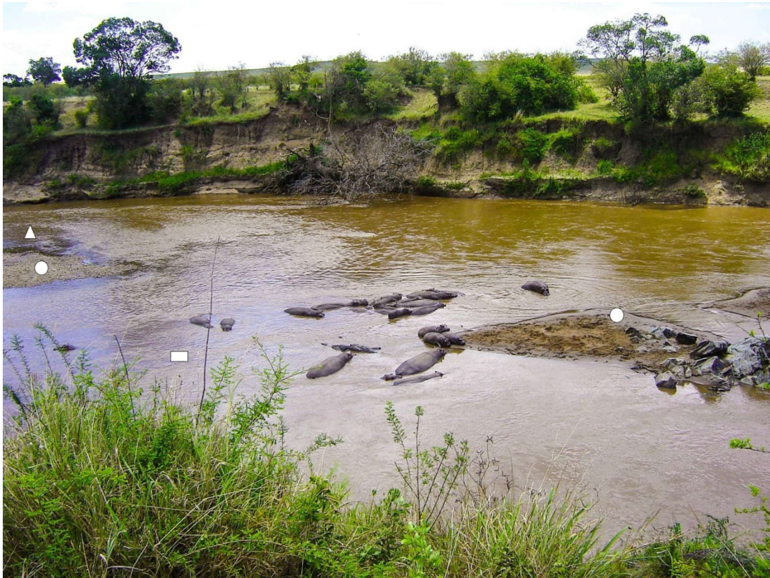
No.13: Another rapid-pool-bench land system in the river in Africa.