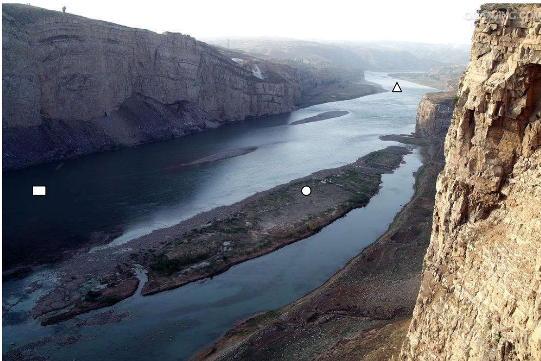
No. 4: A rapid-pool-bench land system in the upper reach of the Yellow River in China.