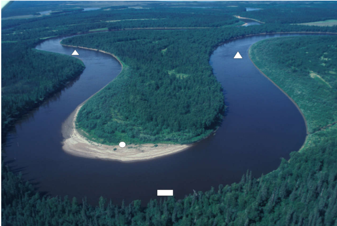
No.11: A rapid-pool-bench land system in the Mississippi River in USA.