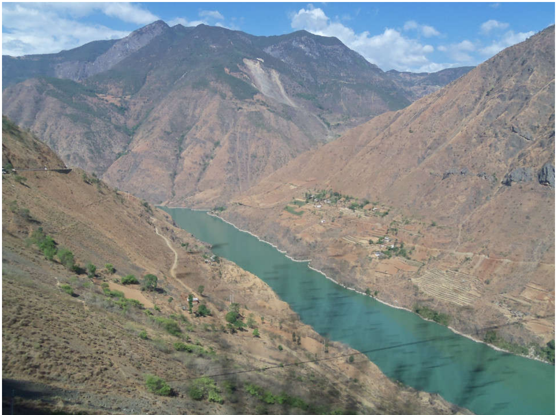
No. 6: A disappearance of the rapid-pool-bench land system in the lower reach of the Jingsha River in China, where a dam has been built.