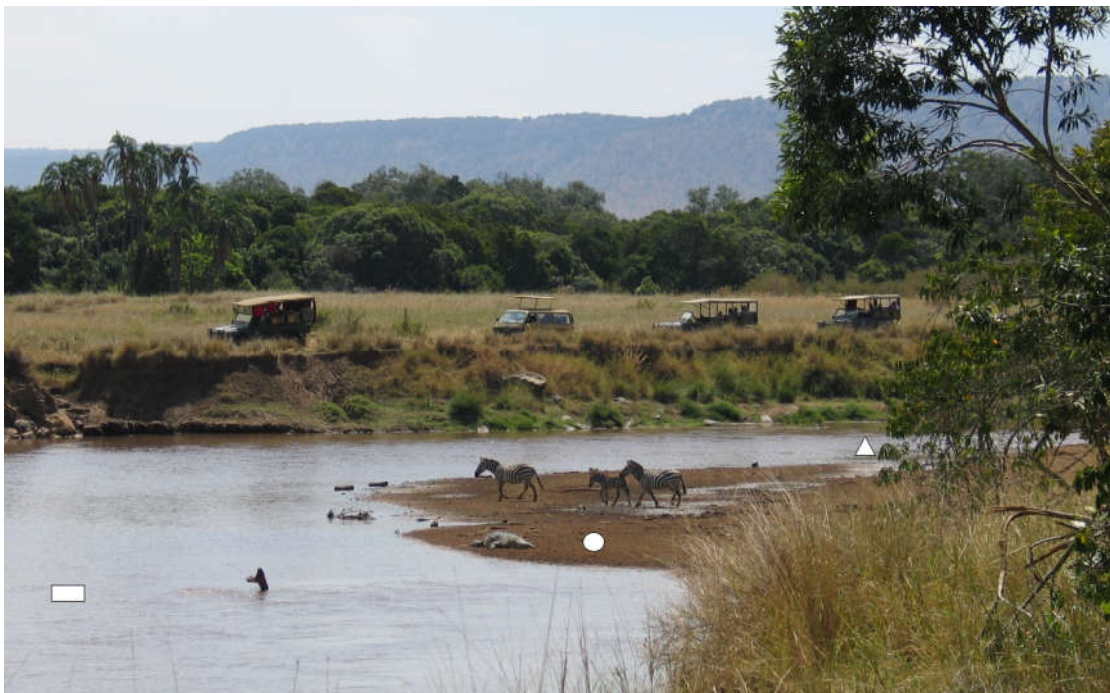
No.12: A rapid-pool-bench land system in one river in Africa.