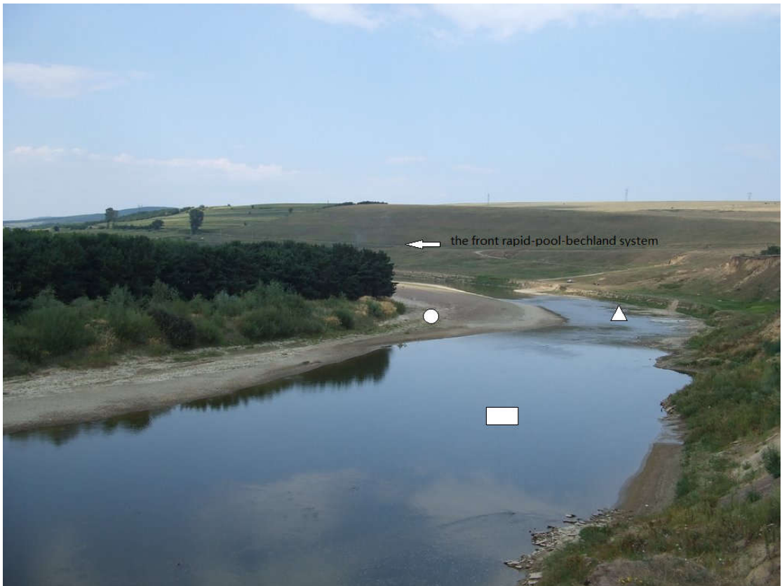
No.10: Another rapid-pool-bench land system in one river in USA.