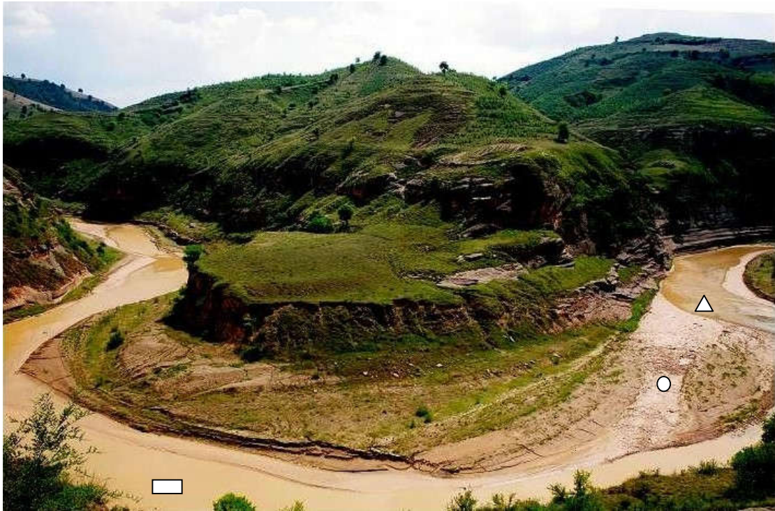
No. 3: A rapid-pool-bench land system in the upper Beiluo River in Shanxi Province in China.