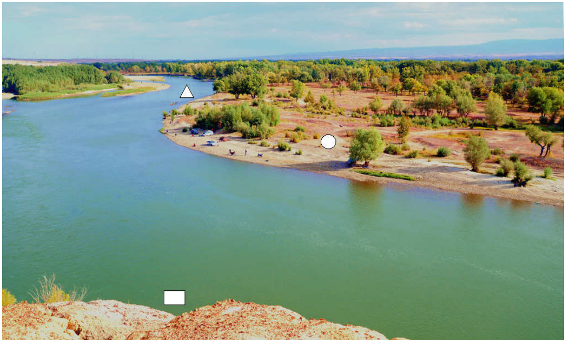
No.16: A rapid-pool-bench land system in the Tarim River of China